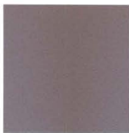
ROSE METALLIC 399A831