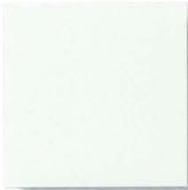
BONE WHITE 391A623