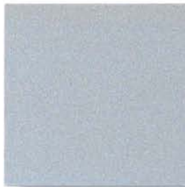
CHAMPAGNE BRONZE 399X493