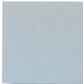
BRIGHT SILVER 399X440