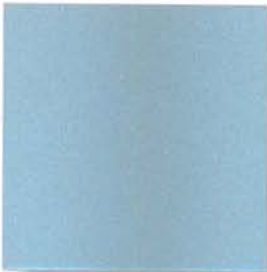
BLUE SILVER 399A660