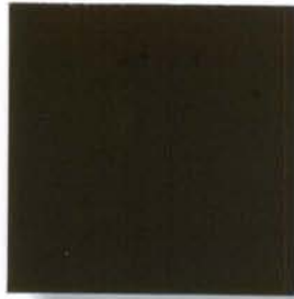
COCOA BROWN 397F266