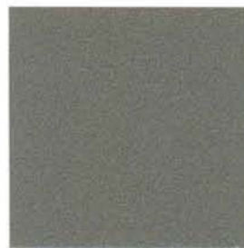
MEDIUM BRONZE 399X501