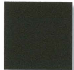
DARK BRONZE 399X446