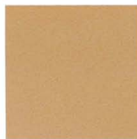
HARVEST GOLD 399A631