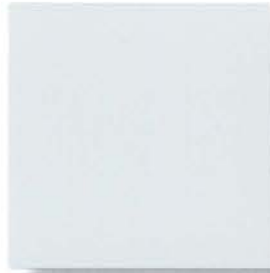
ASCOT WHITE 371X500