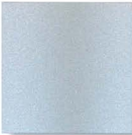
GATWICK SILVER 399A998