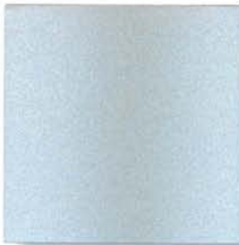
CHAMPAGNE GOLD 399A540